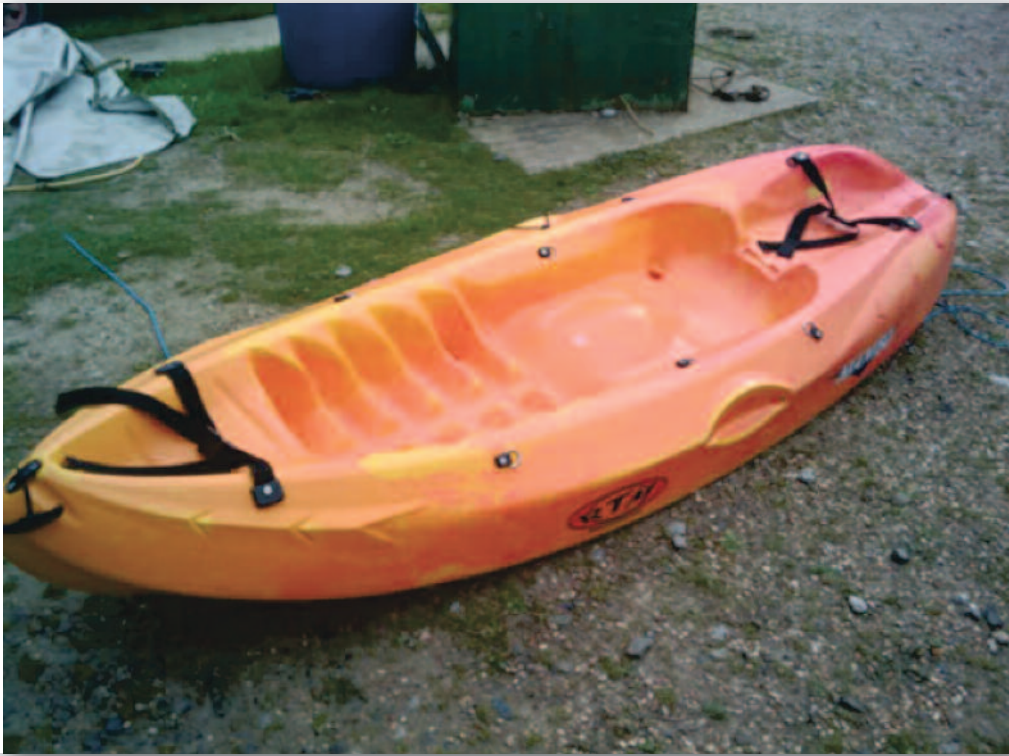
Appendix 9.1 Photo of similar kayaks.